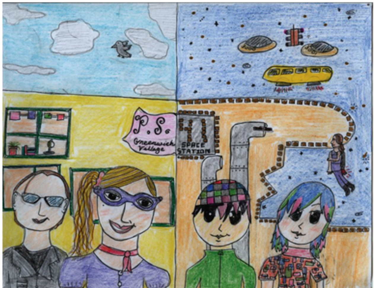
Drawing by Julia, 5th grade, taken from PS41 website