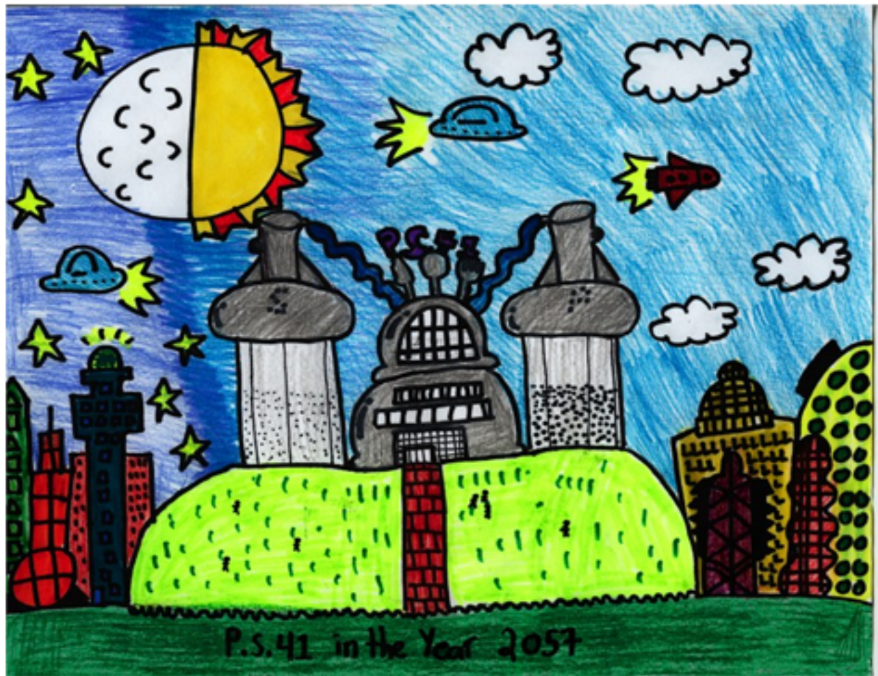
Drawing by Jitan, 5th grade, taken from PS41 website