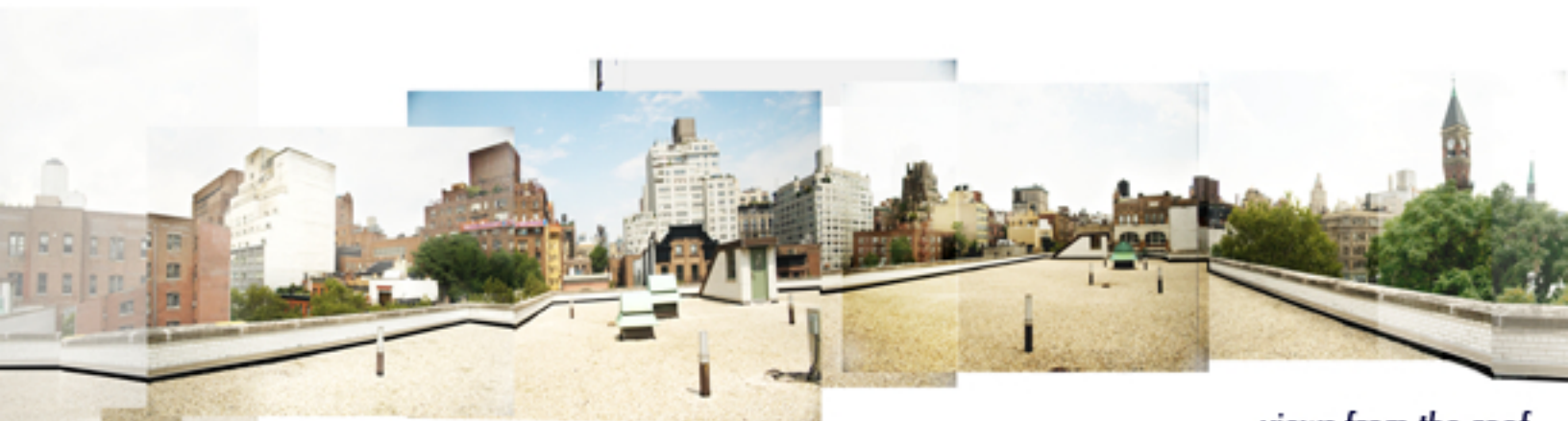
views from the roof

Our goal is to create a learning center dedicated to understanding and improving the environment city children are most familiar with—the urban landscape—while simultaneously promoting environmental and ecological stewardship that has a genuine impact on the world in which we all live. By integrating the scientific method into the curriculum, and by conducting research, generating data, and witnessing the verifiable effects of empirical experimentation, GELL will engage students in a manner that extends far beyond the rooftop classroom-laboratory. For years to come, as students' minds grow and learn, they will benefit from the rigorous hands-on scientific investigation GELL provides from one generation to the next. "