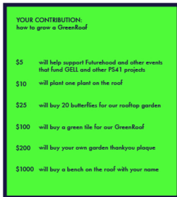
donation board example

The location and openness of Futurehood highlights our participatory goals. With the focus on the children we invite through example other community leaders to play their part in public education, be that financially or through participation. We encourage interested participants and local business leaders to take an active role in producing this and subsequent events.